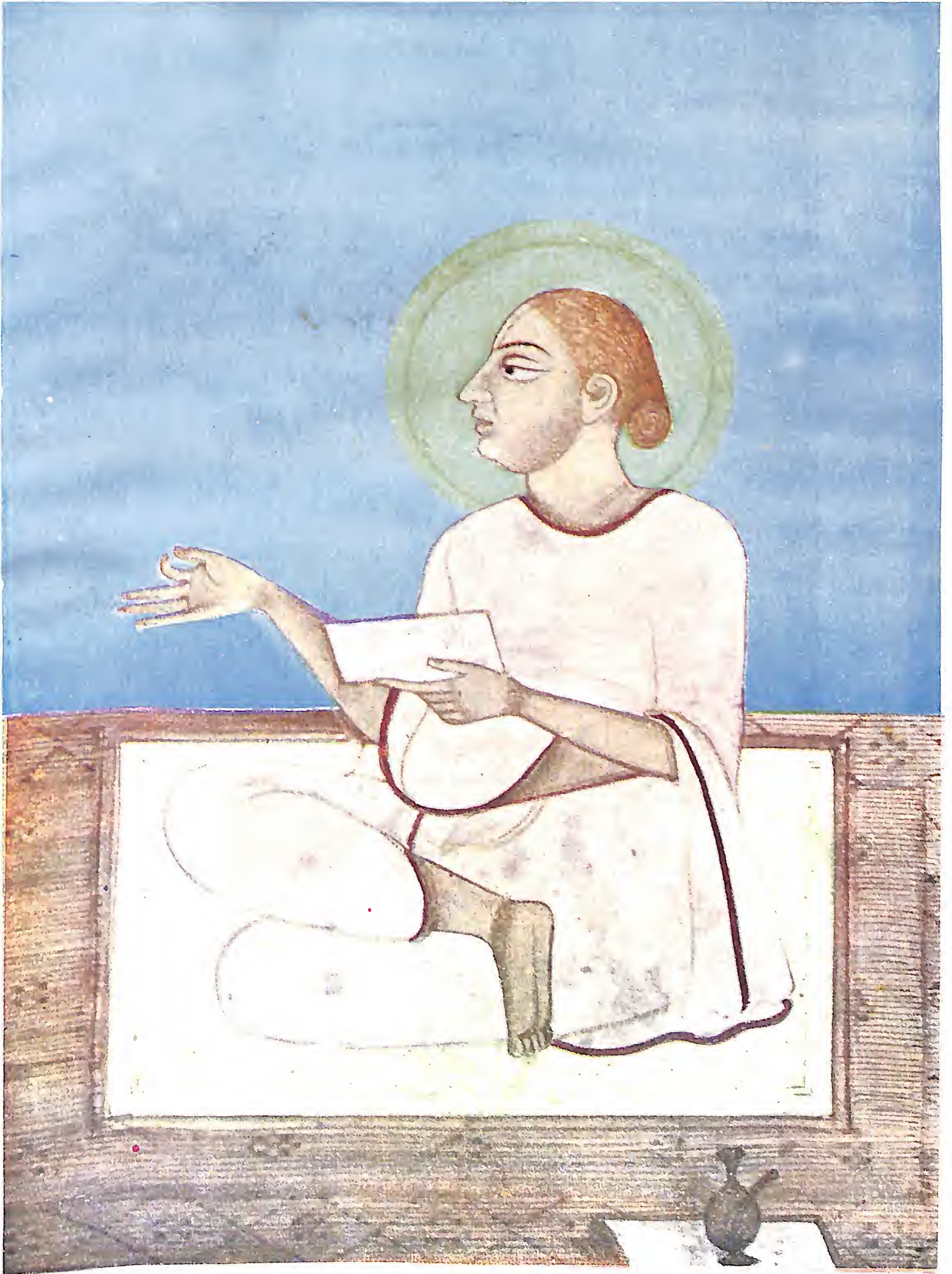
SHRIMAD VALLABHACHARYA A. D. 1479-1531